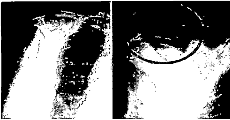
(Left) Normal outlet view x-ray. (Right) Abnormal outlet view showing a large bone spur causing impingement on the rotator cuff.

Magnetic resonance imaging (MRI) and ultrasound. These studies can create better images of soft tissues like the rotator cuff tendons. They can show fluid or inflammation in the bursa and rotator cuff. In some cases, partial tearing of the rotator cuff will be seen.